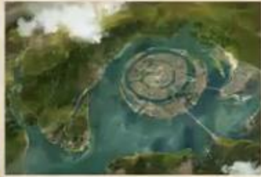
Atlantis - 9600BC +