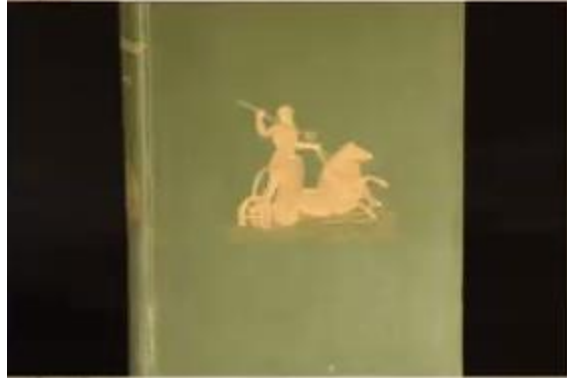
19 th Century Texts