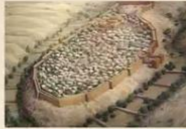
UR / Jerrico - 9000BC